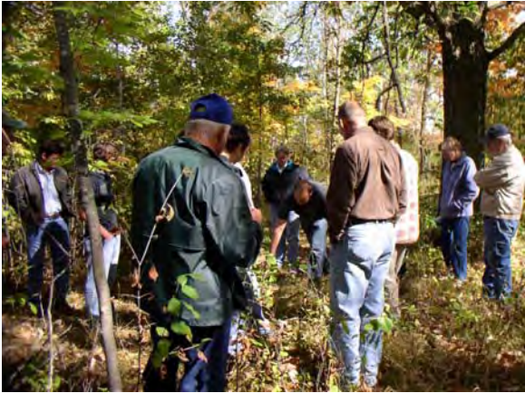
Buckthorn Field Day