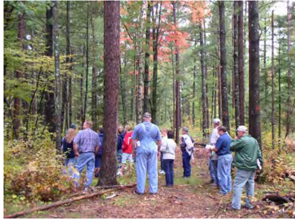
Stewardship Field Day