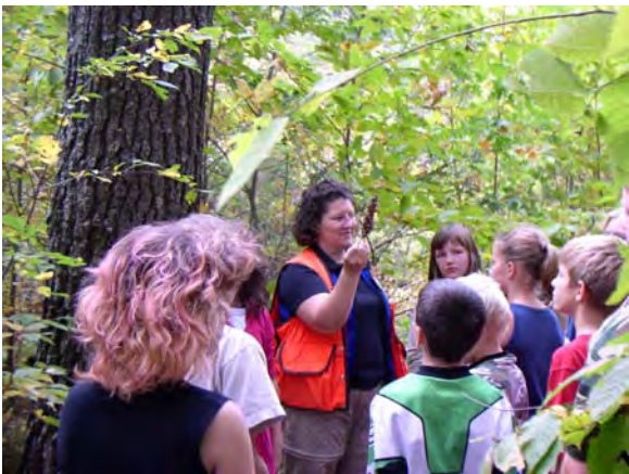
Conservation Days with 5th Graders